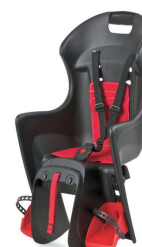
Font and back bicycle seats