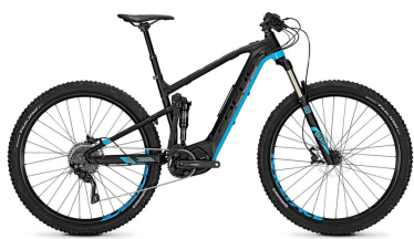
e-mtb full suspension