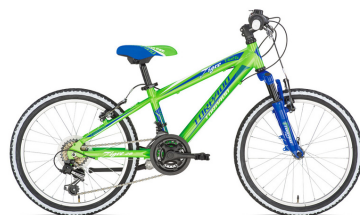
Junior bikes 16" - 20" - 24"