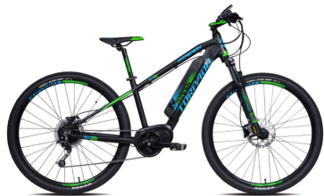
e-mtb front suspension